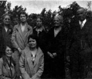
Ten children living at time of mother's death June 14, 1929

At the left is the Golden Wedding Picture taken in July 1916